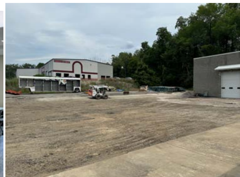
From left to right: the front of the new office building at Inco Johnstown; our new state-of-the-art conference and training room; and the nearly completed new employee parking lot.

Finally, after nearly a year, the construction work is completed for the renovation of our new office building at Inco Johnstown, as well as a number of warehouse improvements, and the team is gradually moving into their new offices!