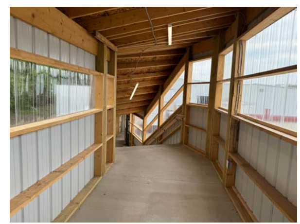
From left to right: a soon to be paved lower parking lot between our new office building and our existing Johnstown facility; and the new walkway to connect the new office building to the older sales annex building.